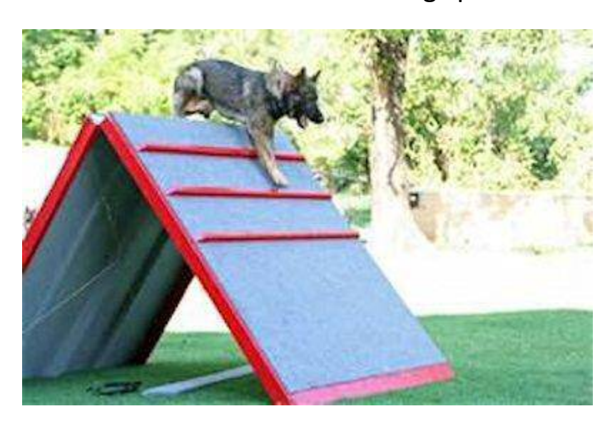
Now... The Sport

schutzhund is a German word meaning "protection dog".